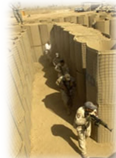
Class IV Bastions