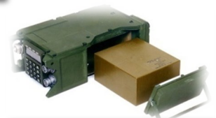
Class IX - Batteries