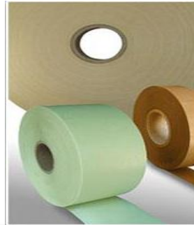
Class II Nomex Fiber