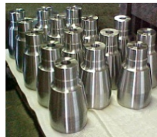
Class IX: Specialty Steel