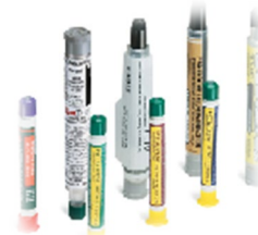
Nerve Agent Antidote Auto Injector